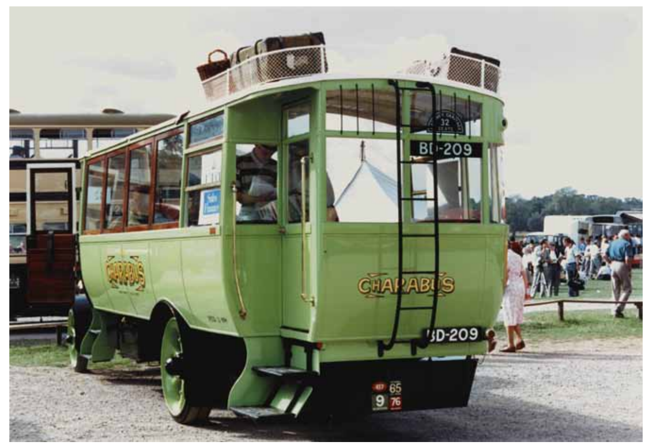
Fortunately the original Dodson Charabus body survived and Mike Sutcliffe made a magnificent job of restoring it to its former glory as can be seen in this rear view of BD 209.