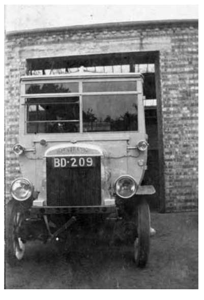
The frontal aspect of BD 209.