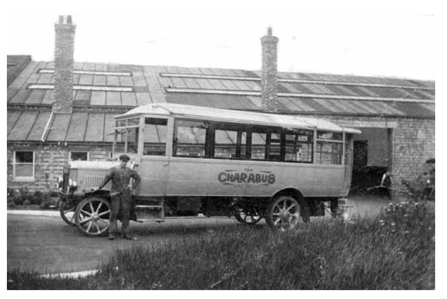
A side view of BD 209 taken at United Counties' Irthlingborough Depot.