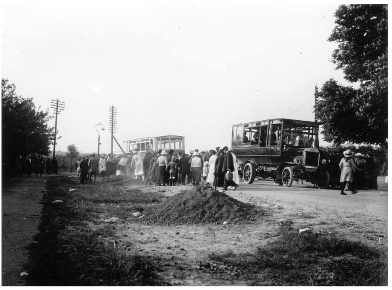
Dennis BD 6237 is seen here showing "To Kettering" on its destination display, possibly at Wicksteed Park, Kettering circa 1922. The saloon on the left of the picture has not been identified.