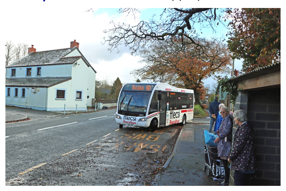
Richards Brothers' Bwcabus fflecsi Optare Solo YJ66 ANR is seen reversing away having dropped a number of passengers off at Clarbeston Road to connect with the 313 journey due to Haverfordwest. This bus had just arrived from Crymych on the Friday-only 642 service, although it had displayed 601 (the default route number shown when operating demand responsive Bwcabus journeys).

Funding for the Bwcabus fflecsi Network in Pembrokeshire, Ceredigion and Carmarthenshire, which was a mixture of demand responsive and fixed timetabled journeys, came to an end on 31st October. The services had been funded through a Rural Development Programme Grant but when that ended in June 2023 the Welsh Government stepped in to cover the cost until 31st October. All efforts to secure future funding failed, except for the Pembrokeshire element of the service for which Pembrokeshire County Council found additional funds from the existing bus service budget to cover the operation until 31st March 2024.