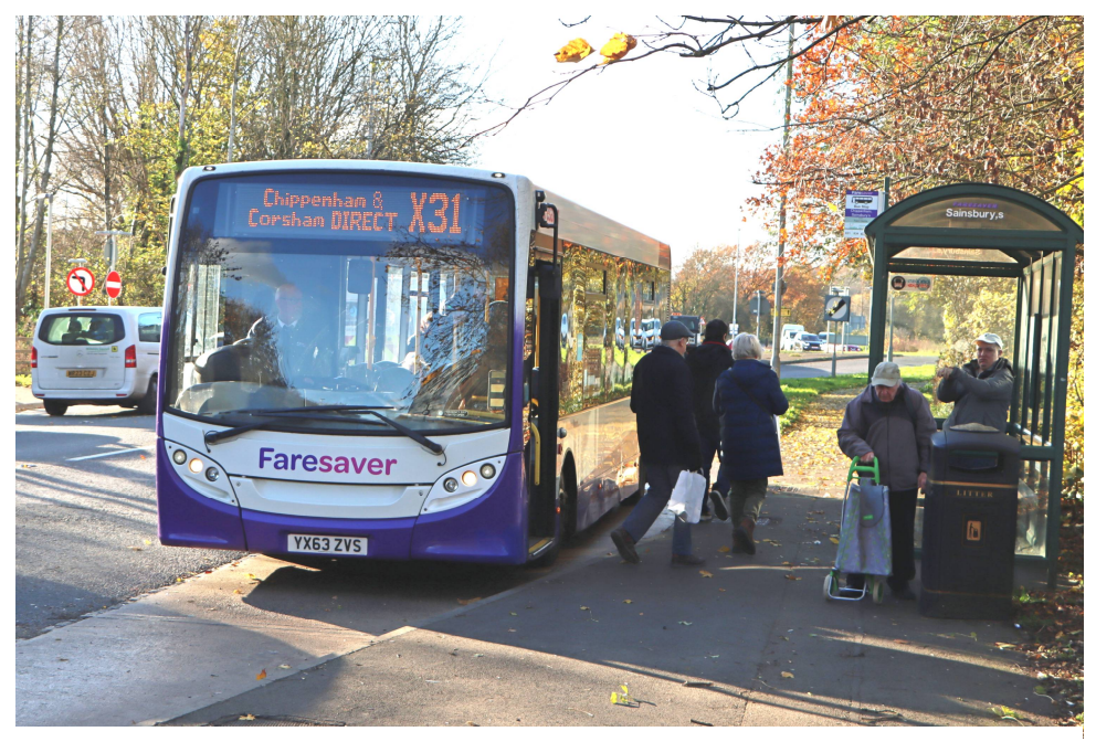
Enviro 200 YX63 ZVS sets down passengers outside Chippenham Sainsburys on the 1300 journey from Bath on Friday 24th November. The bus has a good load and this destination makes a very clear statement that the X31 is now a DIRECT bus to Corsham and Chippenham.

At a time when the main talk has been about service and frequency cuts to commercial services it is refreshing to report a service enhancement.