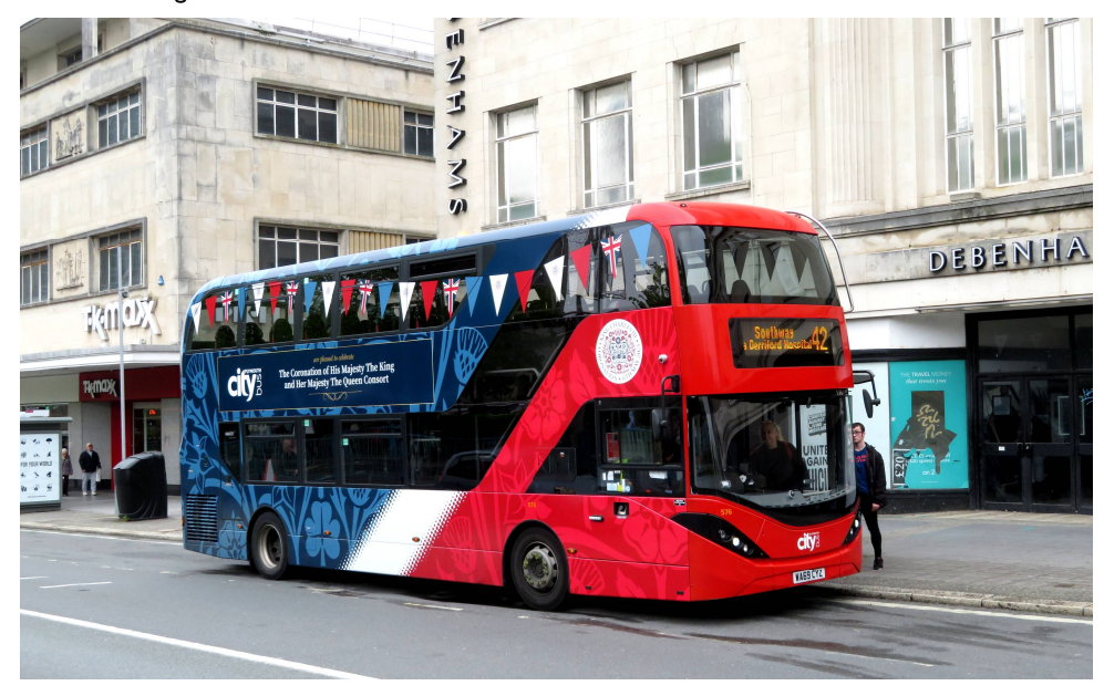
During Spring 2023, Plymouth Citybus gave ADL Enviro 400 City 576 (WA69 CYZ) an all-over wrap to celebrate the coronation of King Charles III. It is seen outside the former Debenhams store on Royal Parade on 9th May operating service 42 to Southway.

42 / 42A / 42C (Royal Parade-Mutley Plain-Crownhill-Derriford Hospital-Southway/Tamerton Foliot/Woolwell)D. All journeys now run direct via Tavistock Road between Crownhill and Derriford, the deviation via William Prance Road & Brest Road through the Seaton Business Park being withdrawn.