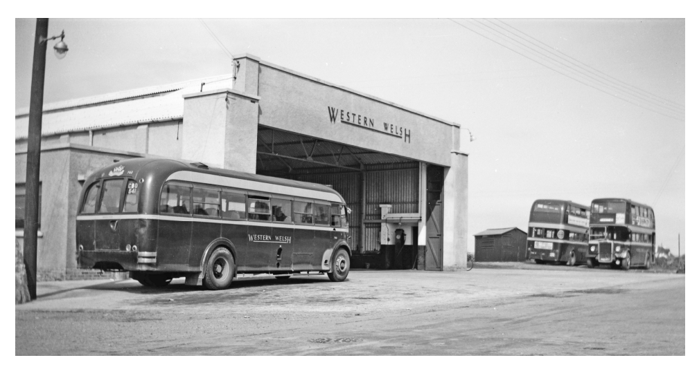
Above - This Charles Dunbar photograph from the Bus Archive shows the Western Welsh depot in St Davids when it was operational (see page 26 of this Bulletin for how it looks now). The single-deck bus outside the depot is CBO 541, a Leyland TS8 new in 1940 with a 32-seat ECW body. The two double-deckers are not identified. This photo was printed in an article in Passenger Transport in December 1955.

Below and overleaf: Three further shots of St. Davids depot taken by Glyn Bowen which are held by the Cardiff Transport Preservation Group photo archive.