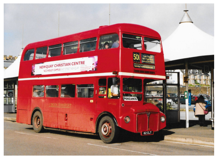
After working the first out and back journeys on Leedstown route 513, Western Greyhound's AEC-PRV Routemaster RM 1062 switched to Land's End route 501. It was photographed in Penzance Bus Station with a blind display reading: 'Last Day of WG Operation Saturday 2<sup>nd</sup> November 2013. Thanks for your support'. Note the Penzance destination slipboard displayed in the windscreen.

Saturday 2nd November 2013 was the last day of Western Greyhound's operation in Penwith when I planned to travel on five WG routes. I left Helston at 0747 aboard First D&C's Volvo Olympian 34131 working route 2A which arrived in Penzance on time at 0851. attention Му immediately drawn to the unexpected presence of Western Greyhound's AEC-PRV Routemaster RM 1062 on stand at the Bus Station ready to work the first route 513 journey to Leedstown at 0857, driven by Mark Howarth, I resisted the temptation to ride on the Routemaster.