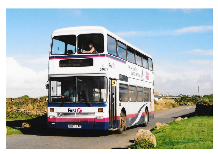
Ten years ago, West Cornwall was something of a refuge for ageing Olympians. First Devon & Cornwall's 1993 ex-Bristol Northern Counties-bodied Leyland Olympian 34629 (K629 LAE) was approaching Land's End terminus on 23<sup>rd</sup> October 2013.

My bus was making one of two weekday 501 journeys routed via Crows-an-wra and Sennen Cove Land's End. Some tight manoeuvring was First necessary when Devon & Cornwall's (First D&C) Volvo Olympian 31877, working route I towards Penzance, was encountered along narrow lane near Crows-Trident an-wra. The reached Land's End five minutes down on time at 1329 and, perhaps because his bus was running late. the driver did not head to the bus but stop continued along the exit Only road. my