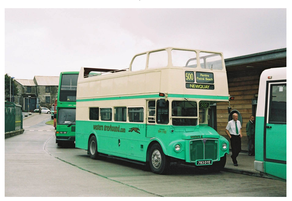
A photograph from happier days at Western Greyhound. Open Top RM 1783 sits in Newquay Bus Station on the 23<sup>rd</sup> June 2007 waiting for the next departure on the 500 to Fistral Beach. New to London Transport in January 1964 this bus is still in active service with Countrywide Coaches Ltd t/a Routemaster4hire from High Wycombe. www.routemaster4hire.co.uk

The greatest loss of all-year bus service was suffered by communities along the north Penwith coast. The section of route 504 between Land's End and St Just was not replaced, neither was route 507 which connected St Just with Gurnard's Head Hotel. A small part of the void was filled from 24th February 2014 when three journeys on existing First D&C route 10 from Penzance to Lower Boscaswell were extended to Morvah. A more significant reinstatement of coverage occurred from 2nd June 2014 with the introduction of West Penwith Community Bus-operated route 7 between Land's End and Zennor via St Just.