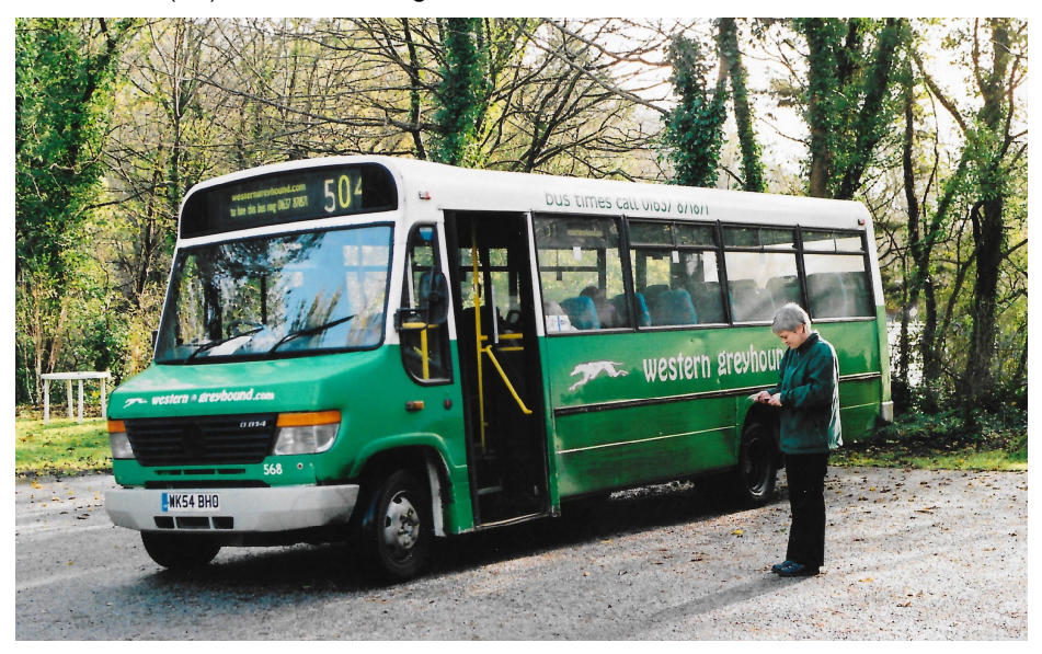
Western Greyhound's Plaxton Beaver 2-bodied Mercedes-Benz Vario 568 (WK54 BHO) and its lady driver were taking a short break at Lamorna, Wink Inn, during its route 504 journey to St Just on 2<sup>nd</sup> November 2013. MB Varios in service on the last day only displayed route numbers, with destination blinds just showing the company name and telephone number.

as doing so would have disrupted my planned schedule to ride five other routes, instead remaining true to my purpose by leaving the Bus Station at 0914 aboard WG's 2004 Plaxton Beaver 2-bodied Mercedes-Benz (MB) Vario 568 working route 504.