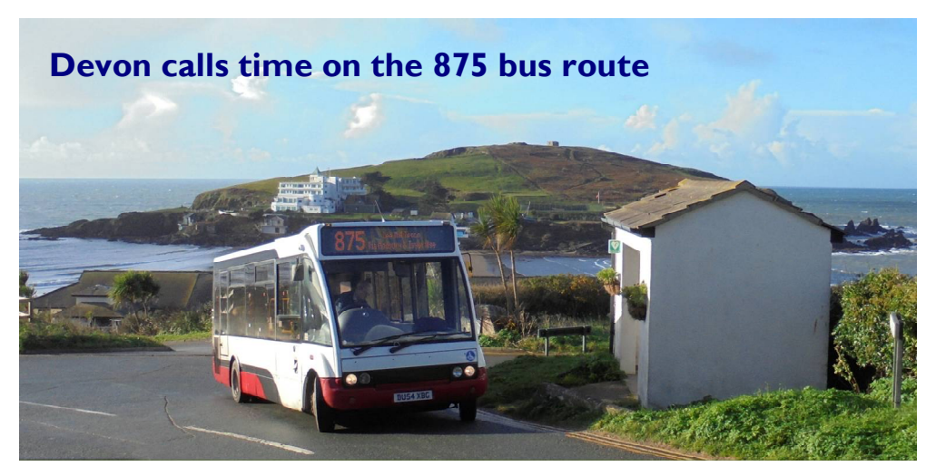
With Burgh Island and its hotel in the background, Oakleys Coaches Optare Solo DU54 XBG awaits departure on the last ever Devon County Council route 875 to Lee Mill via Modbury & Ivybridge.

Bus service 875 (Bigbury – Lee Mill) was withdrawn after operation on Tuesday 7th November 2023. Oakleys Coaches have been operating this bus service since April but gave notice on the contract. Devon County Council tendered for a replacement bus service and received a price which was significantly greater than the cost of providing a Fare Car, given the expected demand for the service. The service had previously been operated by Tally Ho! Coaches but the company handed back the contract in April, blaming a lack of drivers.