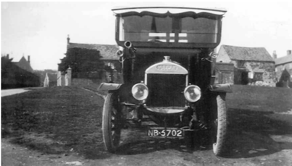
A head-on view of Vulcan NB 5702 taken at Woodford.

When this photograph was taken, Vulcan NB 5702 had ventured to The Langham Arms at Walgrave. It is not clear whether it was still in James Hawes' ownership at this point or whether it had passed to one or other of two Walgrave operators, as the people photographed with the bus are said to be locals. On the other hand neither Walgrave operator is known to have run a Vulcan bus.