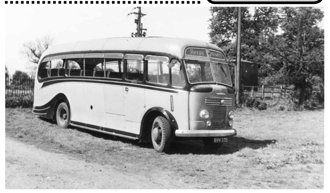
By the time this photograph was taken the Harrington bodied Commer Avenger BVV 379 had passed to Heeps Garages of Guilsborough.

Thereafter Duston Garage operated no more full-sized coaches but six years later, in 1962, operated a minibus. In fact they operated six minibuses one at a time until August 1981, all seating eleven or twelve passengers. Details of these are shown in the rolling stock schedule below. The fact that only one minibus was operated at a time suggests that Duston Garage had a contract for its operations but the Author is unaware what that may have been.