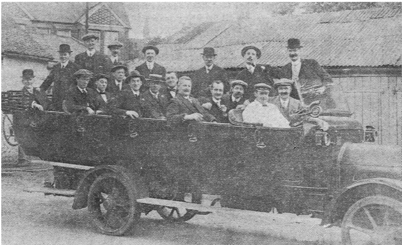
The same vehicle, with its canvas hood furled, carrying a party from the Racehorse Inn.

NHxxxx? – Maudslay 20hp – Hollingsworth – Chara 25 – New 4/14 – Sold 9/18.