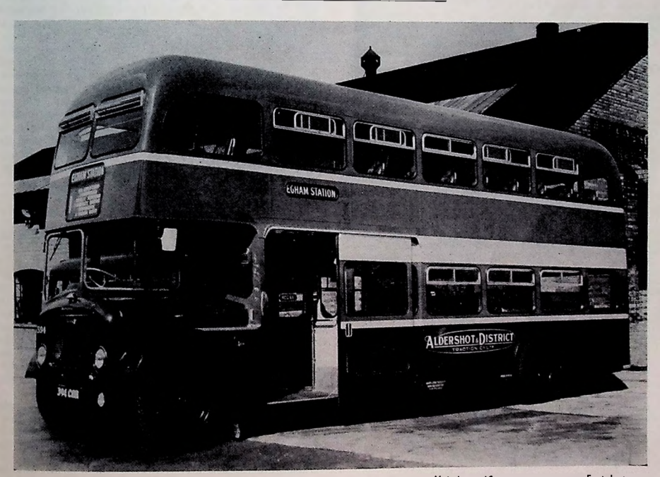
A letter on page 215 mentions Aldershot & District's Mark I Dennis Lolines, which have 68-seat rear-entrance East Lancs bodywork. The company is now taking delivery of an order for 57 Loline IIIs with 68-seat forward-entrance bodies by Alexander. By the beginning of last month, ten had been completed but only one (394) was in service. Since it came at the end of July, 394 nas been used on services 1, 2, 3c and 4 (Aldershot/Camberley/Egham and Camberley/Old Dean estate).