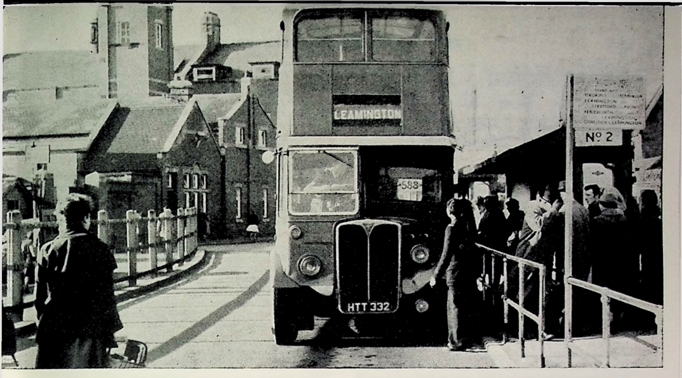
A former Devon General London-type A.E.C. Regent III with Weymann body operated by Green & Griffin, of Learnington, on hire to Midland Red to cover an acute staff shortage.