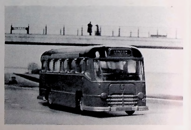
The Corgi model of the Midland Red CM5T.

Playcraft Ltd., who market their models under the trade name Corgi, have just introduced in their Major range an excellent model of the Midland Red CM5T motorway coach. Superbly detailed and complete with windows, it has scats in the interior and the toilet