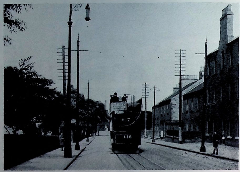
An open-top cable car in Gorgie Road.