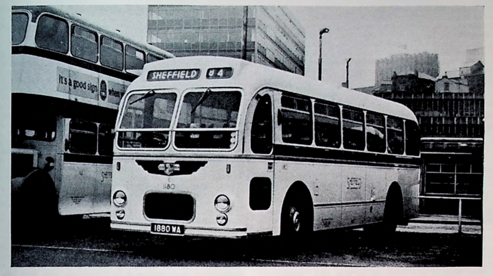
An unusual combination—Leyland Leopard chassis with Eastern Coachworks body (see SHEFFIELD TRANSPORT below).

applied to run jointly on this route and have applied for consent to go outside the city boundary.