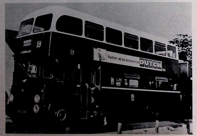
In an attempt to reduce painting time and costs, various simplified liveries have been tried, as on this 30ft. long double-decker.

Although the conversion on the street has been completed, the physical shape of Edinburgh continues to change. In recent years there has been an increase in the construction of dormitory suburbs, while the city centre areas of traditional Scottish tenements is steadily being cleared. This pattern may change in the future as new skyscrapers are constructed in the city centre, but at the moment the bulk of the population now live further from their work than at any time in Edinburgh's history. To keep up with this development there has been a continuous improvement since 1956 in the routes operated by the Transport Department. These are possible because of the flexibility of buses since in many cases routes have been altered away from the main roads to bring transport nearer to certain pockets of the population. Another development has been the introduction of several new circle routes, all of them touching the city centre, but all of them providing new two-way transport facilities.