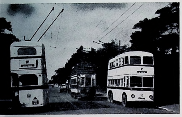
Trolleybuses were used in many places as tram replacements. Here, two Bournemouth MS2s are seen with one of the trams they replaced

One of the attractions of the Belfast undertaking is a ride through the grounds of the Parliament House at Stormont; here trolleybuses ascend stately terraces to deposit visitors at the back door of the seat of legislature! Overhead wiring in Belfast is very neat and complicated (e.g., three concentrical curves all leading out of Royal Avenue into Donegal Square and intersected by another line), and three-axle vehicles have always reigned supreme. The latter remark applies also to Huddersfield, where all tramcar routes but one were converted to trolleybus operation between 1933 and 1940. The emphasis in this town is on through